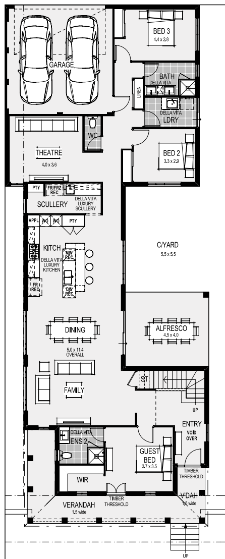
GROUND FLOOR 1:100